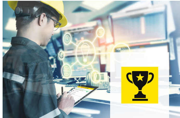
Winner of "Product of the Year 2022" by magazine materialfluss and "Best of Industry Award 2022" by MM MaschinenMarkt

The comprehensive maintenance and repair history is available around the clock at the press of a button, enabling forward-looking maintenance planning. WAMAS Maintenance Center optimizes and documents the maintenance activities. During this process, it significantly enhances the maintenance efficiency and safeguards the availability of your system.