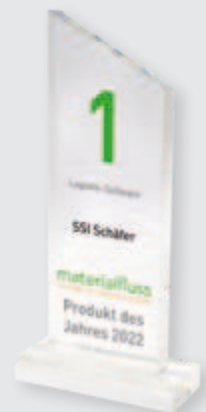
Awarded „Product of the Year 2022“ in the Logistics Software category