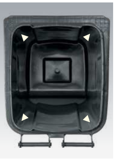
Robust wall construction DU eXtra 140, 240 I