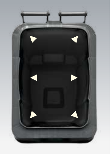
Robust wall construction DU eXtra