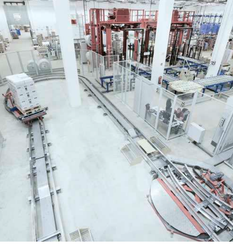
Transport between points of demand via a rail guided vehicle system