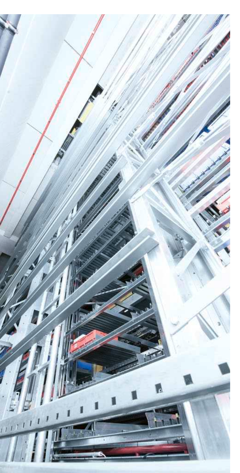
The miniload harbours 136,000 storage locations for double-deep storage