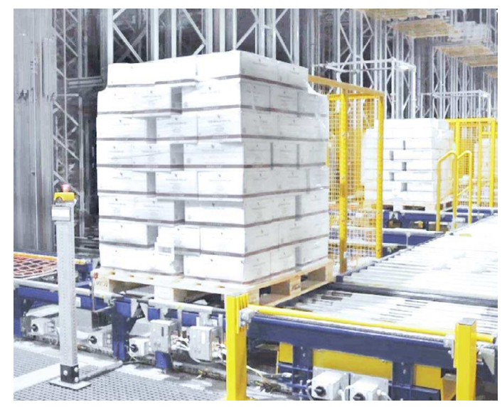
Seamless integration of SSI Exyz SRMs, conveying systems and software

including the warehouse. By combining the latest technologies, equipment, and innovative solutions, the YCH Group can continue to set new standards for supply chain excellence from the leading logistics hub in Singapore and beyond.