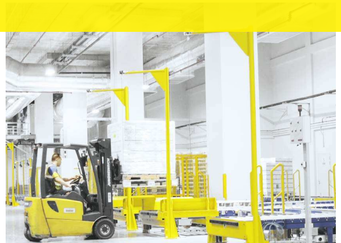
In the ramp-up warehouse, material flow starts with pallet conveyors