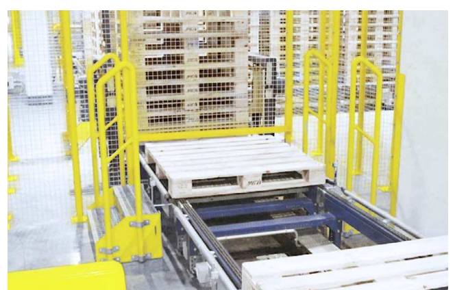
Pallet stacking for continuous automatic process chains