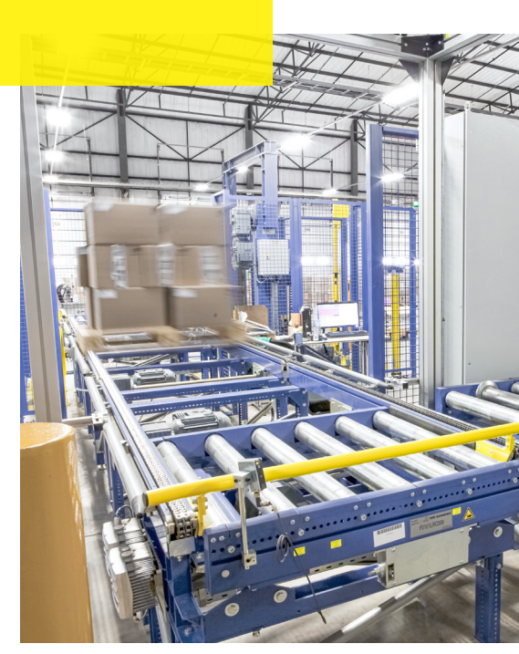
Pallet conveying system