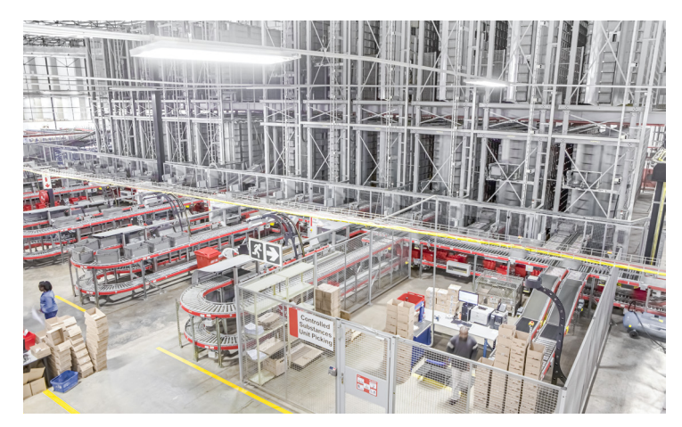
High Bay Warehouse with storage and retrieval machines