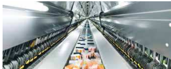
3 AUTOMATIC PICKING