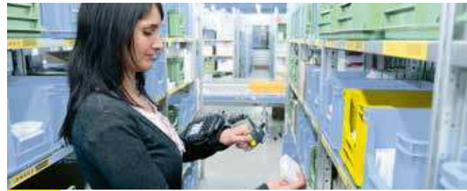
1 MANUAL PICKING

WAMAS® Using our in-house developed WAMAS® logistics software, we combine intralogistics components to create an intelligent overall system. Clear visualizations and comprehensive tools manage processes, resources, and stock levels, ensuring efficient warehouse operation.