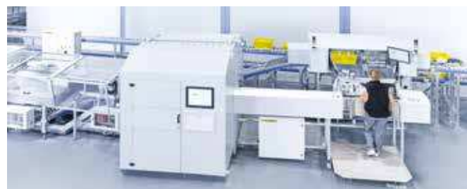
5 PRODUCT IDENTIFICATION