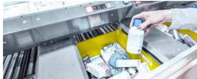
2 WORK STATIONS / ergonomics@work!®