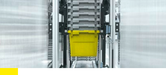
PAPER AND BIN HANDLING