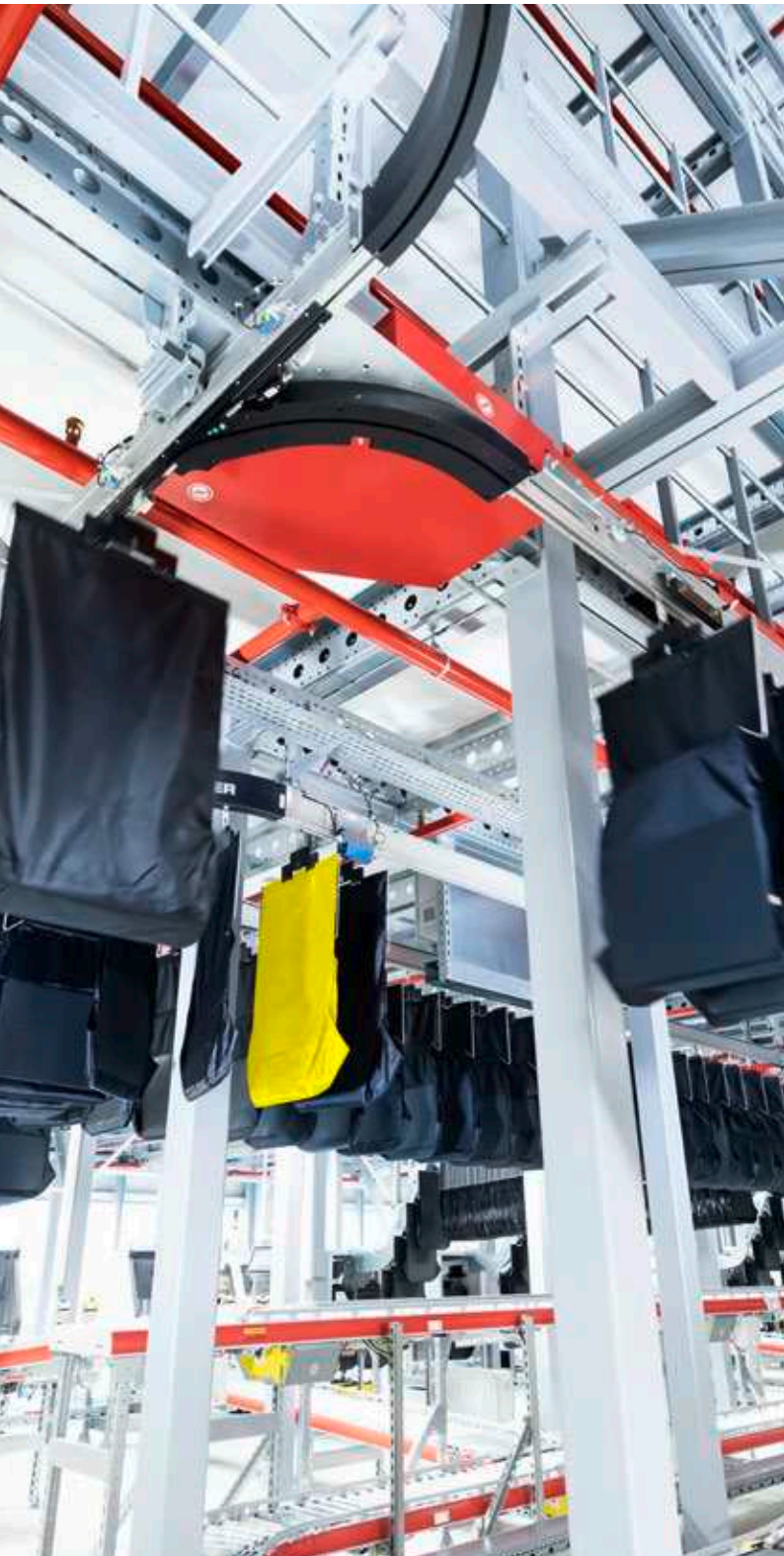
Optimum use of space thanks to hanging transport of goods

The core of the system is the innovative pouch sorter SSI Carrier by SSI SCHAEFER. This modularly designed pouch conveyor enables flexible and gentle transport of flat and hanging goods. It processes smaller orders typical for e-commerce as well as larger retail orders in any combination with a high level of efficiency.