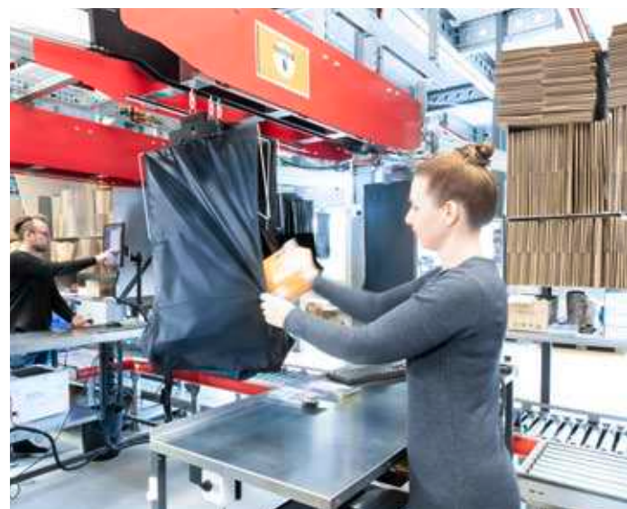
Provision of flat and hanging goods in desired sequence

Then, the order bins are transported to the ergonomic loading stations of the SSI Carrier pouch sorter for further order processing or temporary storage. Bins containing only one order are transported directly to a Value Added Service (VAS) area for store delivery after RF picking. There, the goods are repacked and prepared for shipment to the stores. Bins can also be directly transported to shipping through a consolidation area. This principle is used when several bins or larger goods from the pallet rack system are intended for one order.