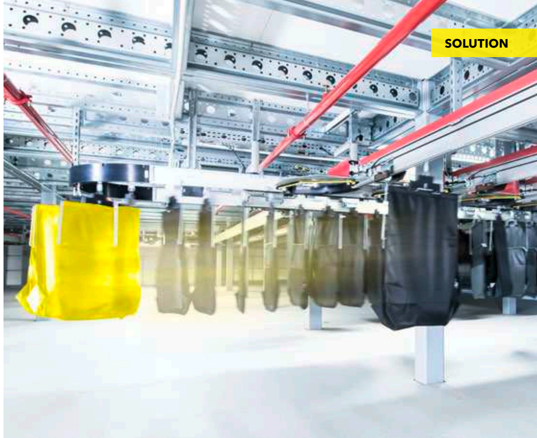
Sorting of pouches in the matrix sorter and creating customer orders in a defined sequence