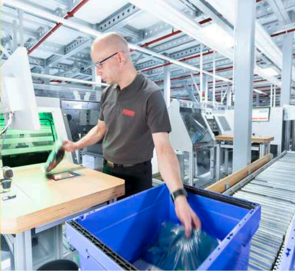
Separation and scanning of products at ergonomic loading stations of the SSI Carrier