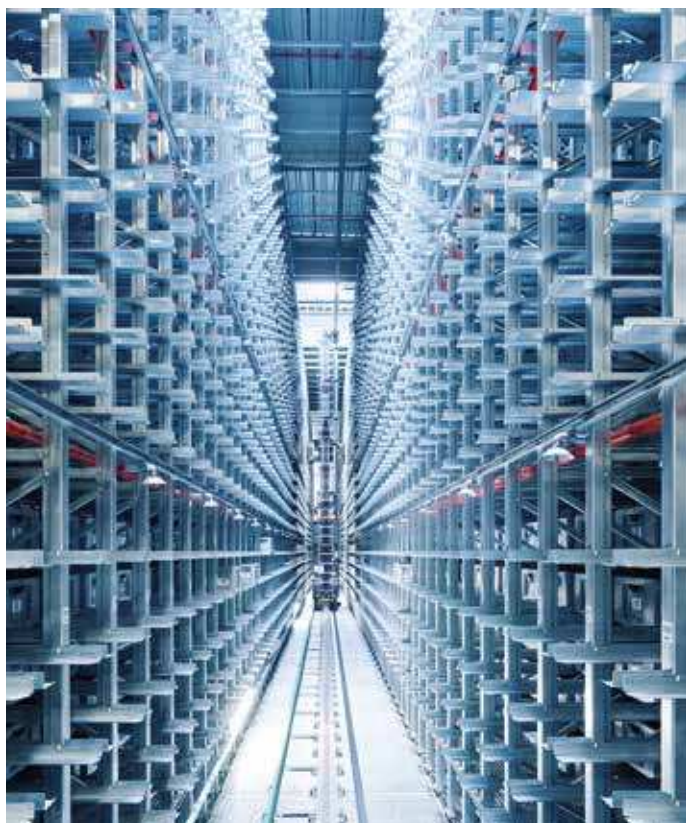
Two-story automated miniloads with Schäfer Miniload Cranes

In addition, as part of the "Maintenance 4.0 for Intra-logistics" concept, smart systems are utilized for status monitoring and for partially automated maintenance of system components. In EDZ Mitte, a total of 58 Schaeffler Smart Checks assume status monitoring of drives relevant to operation for the SMC as well as the Exyz devices. They transfer information for visualizing to the central WAMAS® Lighthouse data platform.