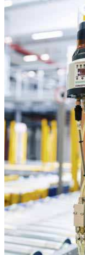
Fully automated lubrication