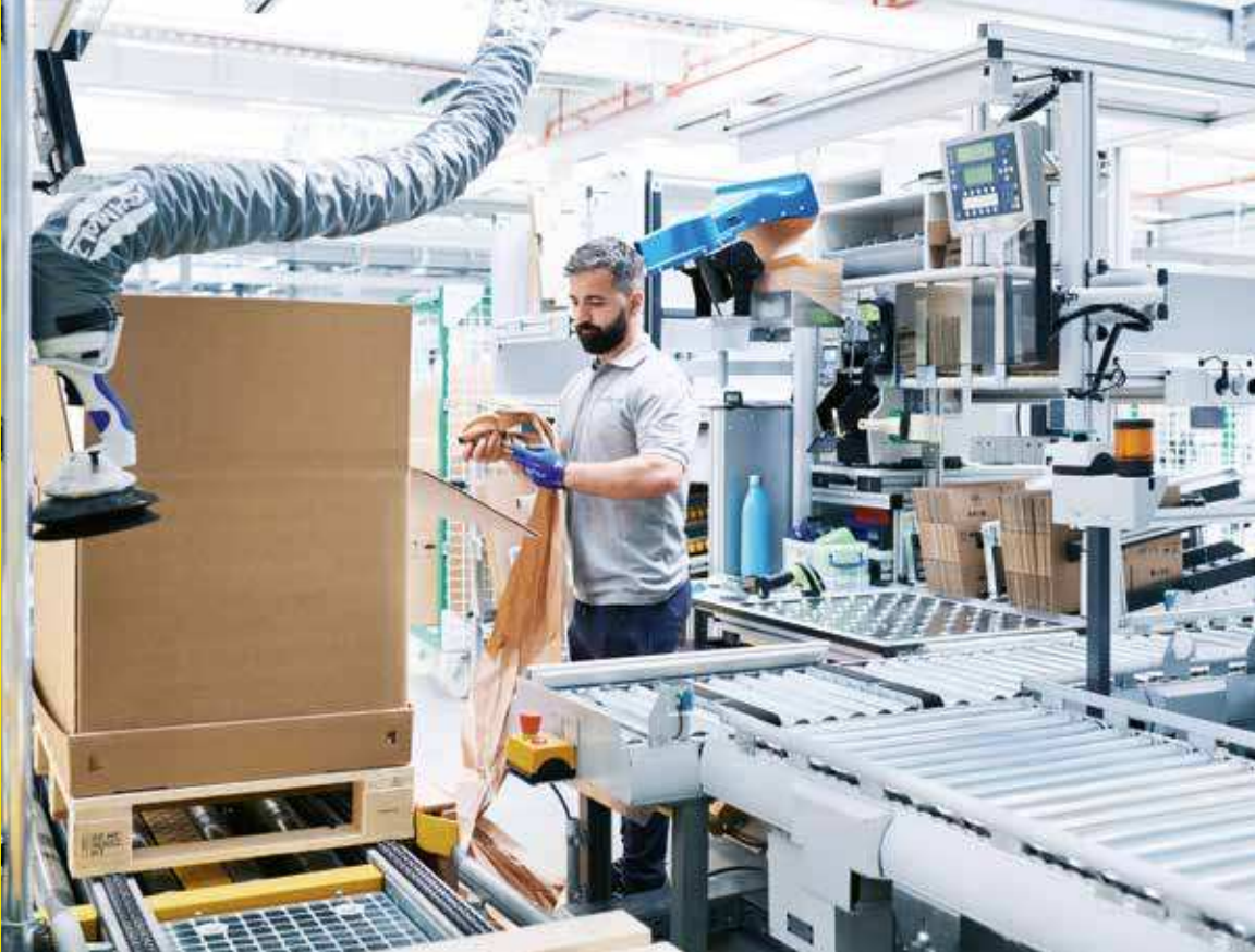
Ergonomic work stations for picking and de-consolidation