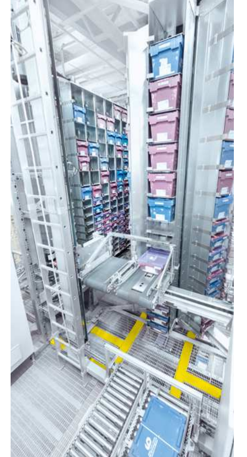
Storage and retrieval SCS