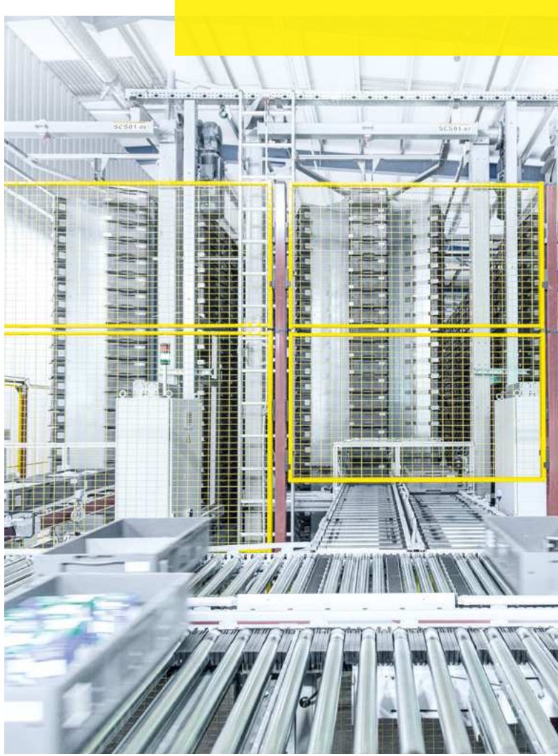
SCS with 11,000 bin storage locations