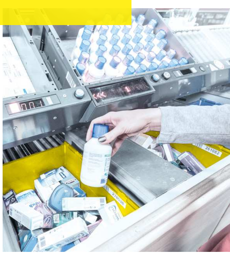
The United Drug distribution center includes a product portfolio of around 10,000 items. More than 6,000 parcels are sent every day.