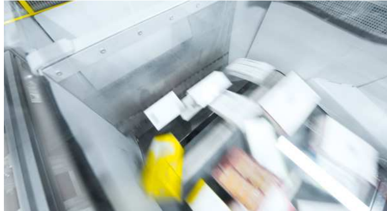
A-Frames with double filling point