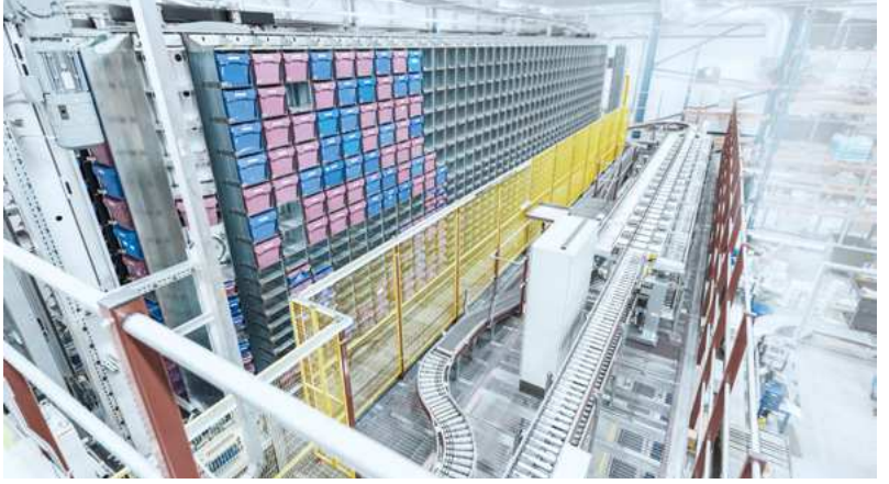
SCS as shipping buffer