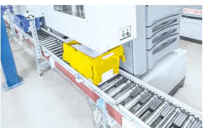
Automatic delivery note insertion