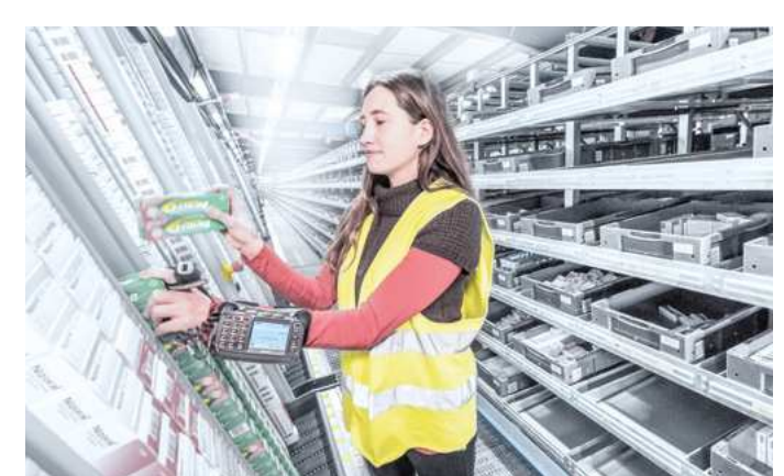
A-Frame replenishment from flow racks

picks per hour and the error rate reduced to almost zero and all this with most gentle product handling. Thus, the system guarantees a high level of performance with highest profitability. For fast provision of the previously picked orders in the correct sequence, four SCS with over 6,000 bin storage locations were installed as a shipping buffer including drop sequencer.