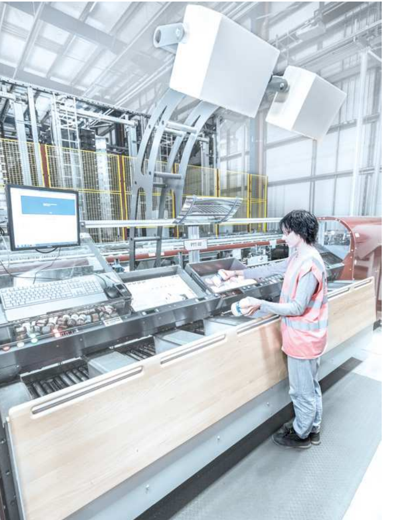
Goods-to-person picking with Pick to Tote