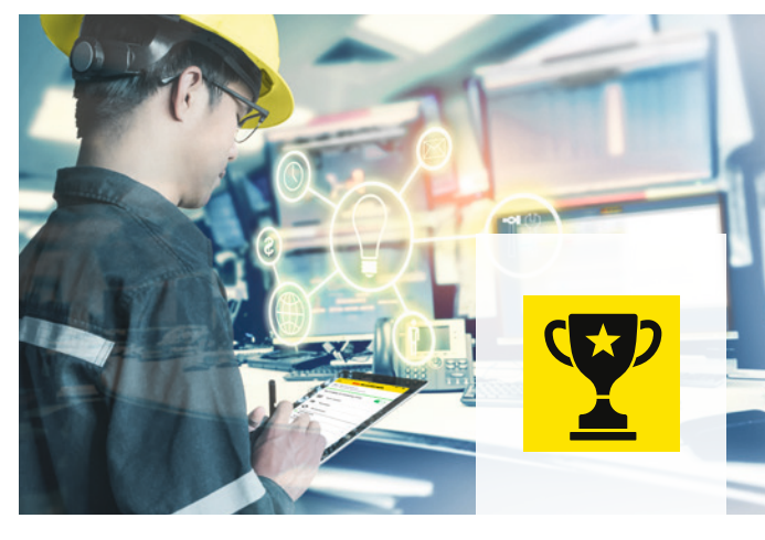
Winner of "Product of the Year 2022" by magazine materialfluss and "Best of Industry Award 2022" by MM MaschinenMarkt

The comprehensive maintenance and repair history is available around the clock at the press of a button, enabling forward-looking maintenance planning. WAMAS Maintenance Center optimizes and documents the maintenance activities. During this process, it significantly enhances the maintenance efficiency and safeguards the availability of your system.