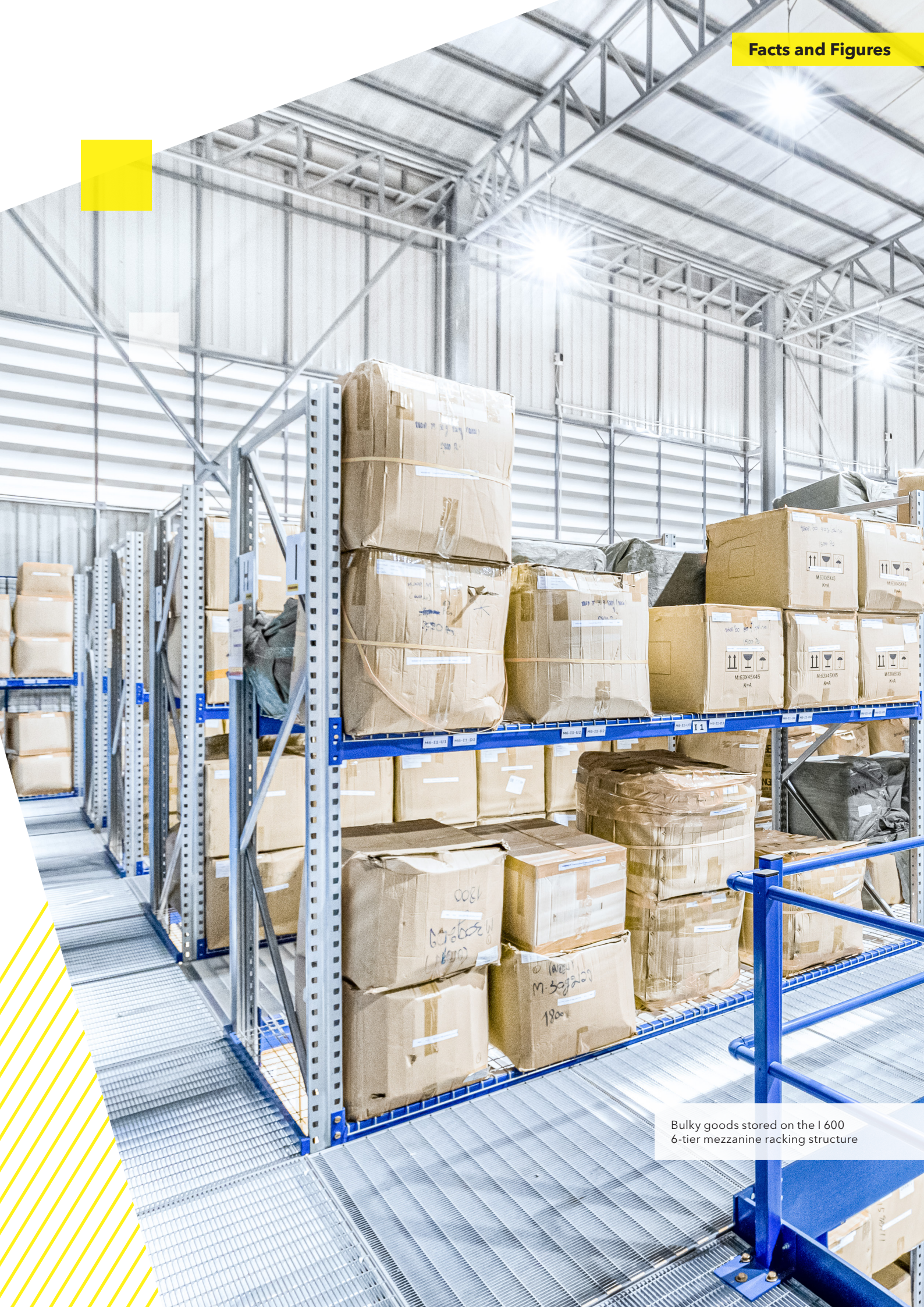
Bulky goods stored on the I 600 6-tier mezzanine racking structure