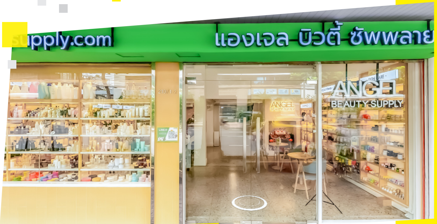
AGL's retail store at 210, 1-2 Lan Luang Rd, Khlong Maha Nak, Pom Prap Sattru Phai, Bangkok 10100, Thailand