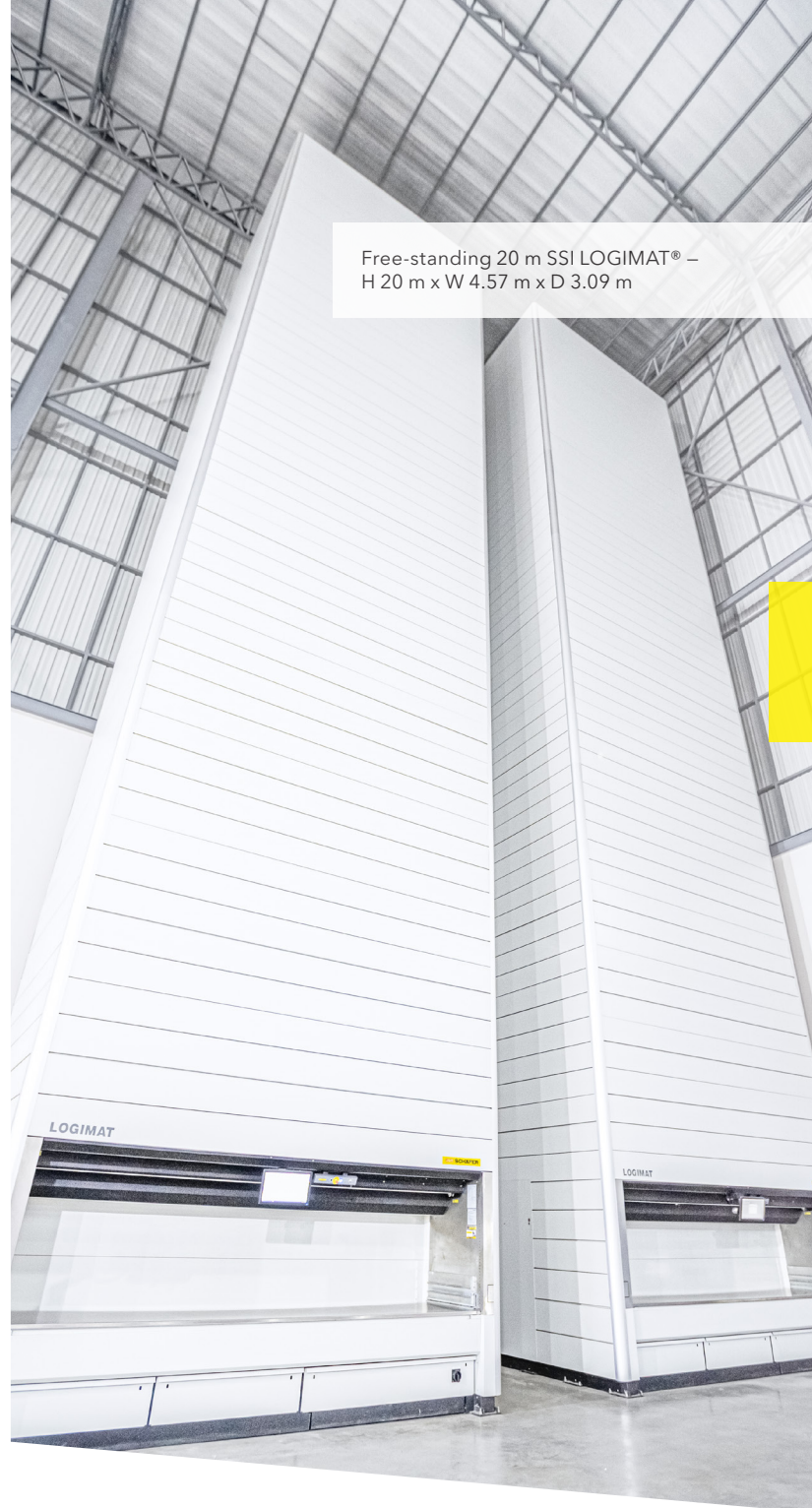
Free-standing 20 m SSI LOGIMAT® – H 20 m x W 4.57 m x D 3.09 m

The WAMAS® LOGIMAT is the inventory management software of the SSI LOGIMAT®. On every shift, different pickers access the system using their designated password. Simply with a touch of the control panel, the software calls the correct tray for either the retrieval or storage of the goods. Compared to the manual storage and picking method, this all-in-one storage and picking process helped AGL reduce a significant amount of time to travel down the aisles of the warehouse to locate the goods. Furthermore, inventory security and stock traceability will no longer be an issue for AGL.