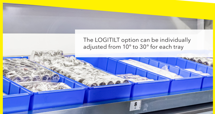
The LOGITILT option can be individually adjusted from 10° to 30° for each tray

To further boost productivity and work comfort, LOGITILT tilts the tray angle from 10 to 30 degrees, in one-degree intervals to improve the accessibility to the tray. The pickers no longer need to bend over the tray since all the goods are within an easy reach.