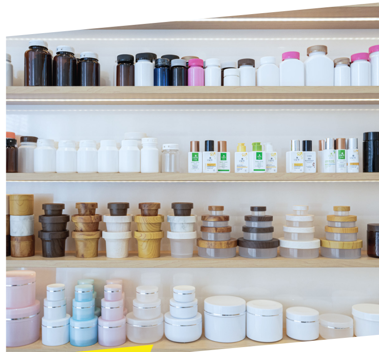
AGL's product range

The global cosmetic packaging industry is projected to grow at a CAGR of 4.1% throughout 2021-2028 1 . This growth is contributed by the increased consumer spending power, beauty awareness, and standards globally. With the adoption of internet use and the rise of e-commerce, B2B commerce space in Asia is growing fast and businesses are going omnichannel to increase their sales. One such company is Angel Beauty Supply (AGL), a family-owned business operating out of Thailand - Bangkok City. As a specialist and distributor in cosmetics packaging, AGL is experiencing about a 4% growth in its business annually. The unassuming one-stop shop offers services such as designing, label printing, and packaging of cosmetics and toiletries products to all types of customers, from local Thai start-ups to international brands. Hence, expanding its sales channel from a brick-and-mortar store to an online store is a natural development for AGL to manage its sales operation effortlessly. AGL turned to technology and semi-automated systems to improve its warehouse operation and to ensure there is flexibility in the inventory storage and picking process.