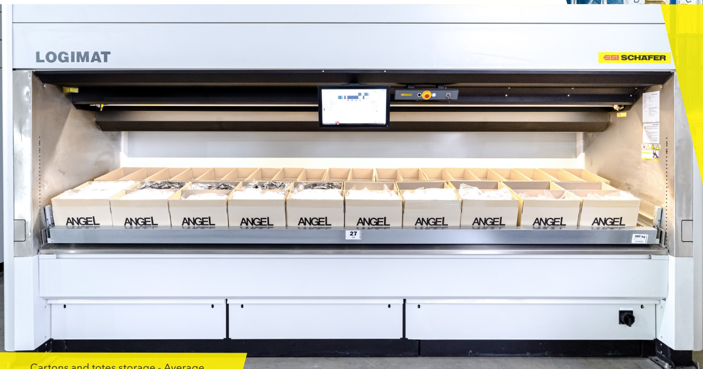
Cartons and totes storage - Average throughput of 191 order lines per day

The combination of bulky storage and small parts storage systems allowed AGL to creatively innovate without much hassle.