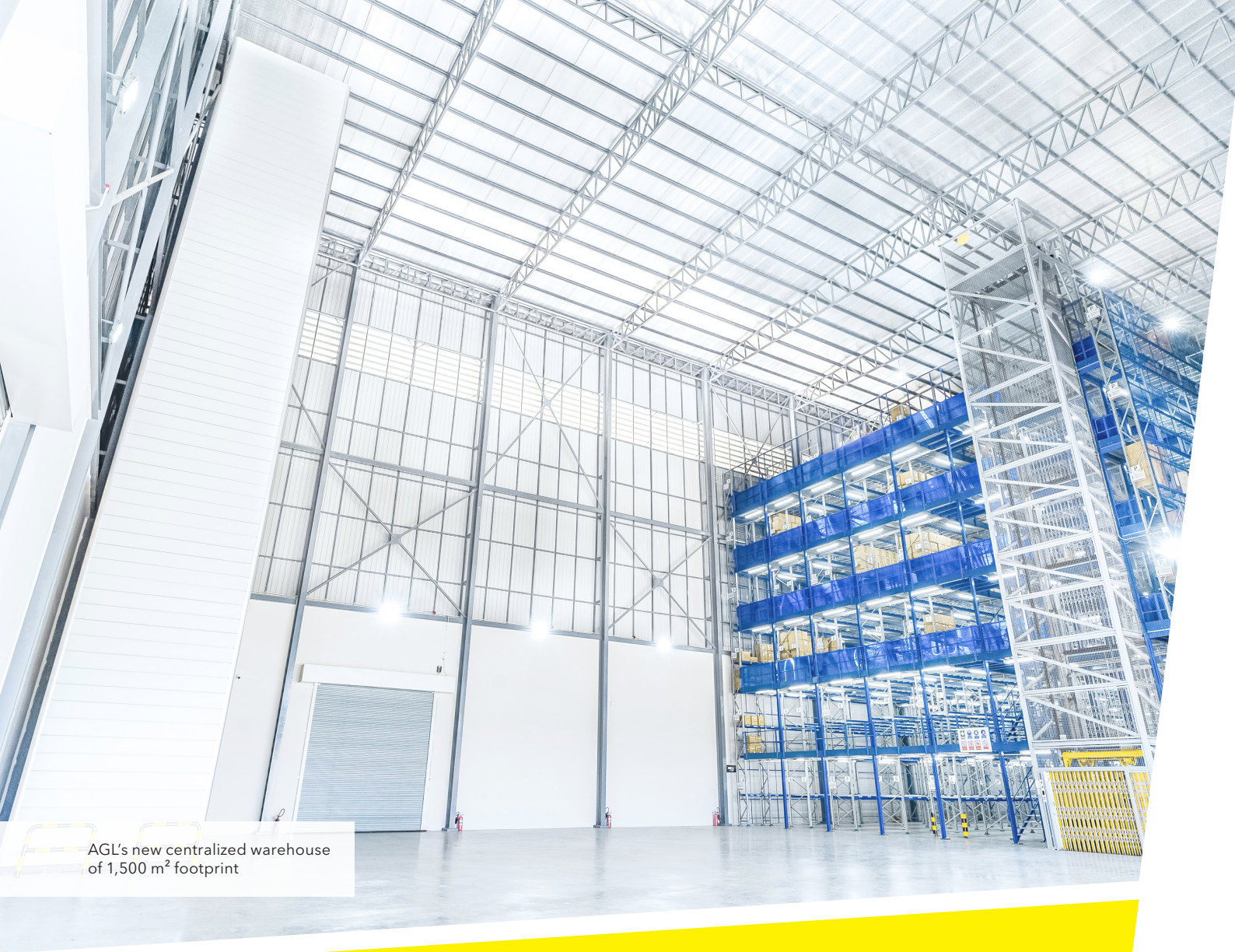
AGL's new centralized warehouse of 1,500 m 2 footprint