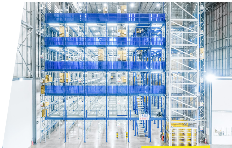
1 600 6-tier mezzanine

AGL's new warehouse stands at a height of 22.5 m and comprises a total area of 2,842 m 2 . To accommodate up to 7,500 SKUs, a volume that is doubled of the five previous warehouses put together.