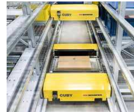
Single-level shuttle Cuby