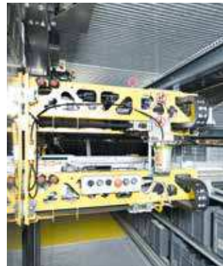
Multi-level shuttle Navette