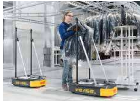
WEASEL®: transport of hanging goods