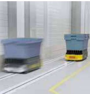
WEASEL®: transport of bins