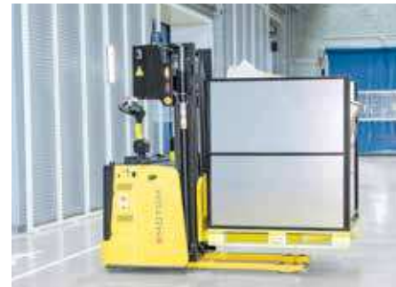
Transport of pallets