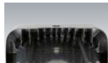
Additional supporting ribs