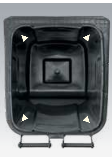
Robust wall construction DU eXtra 140, 240 l