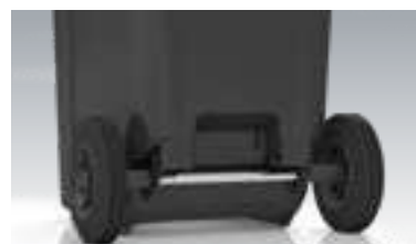
Integrated foothold DU eXtra 180 l