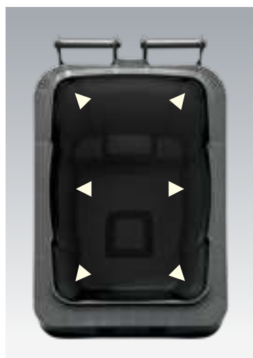
Robust wall construction DU eXtra 180 l