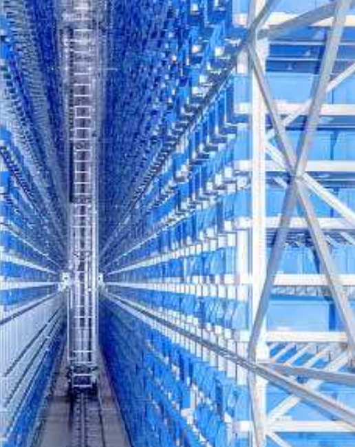
Automated Miniload system