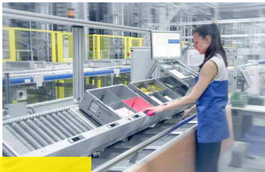
Pick to Tote workstation