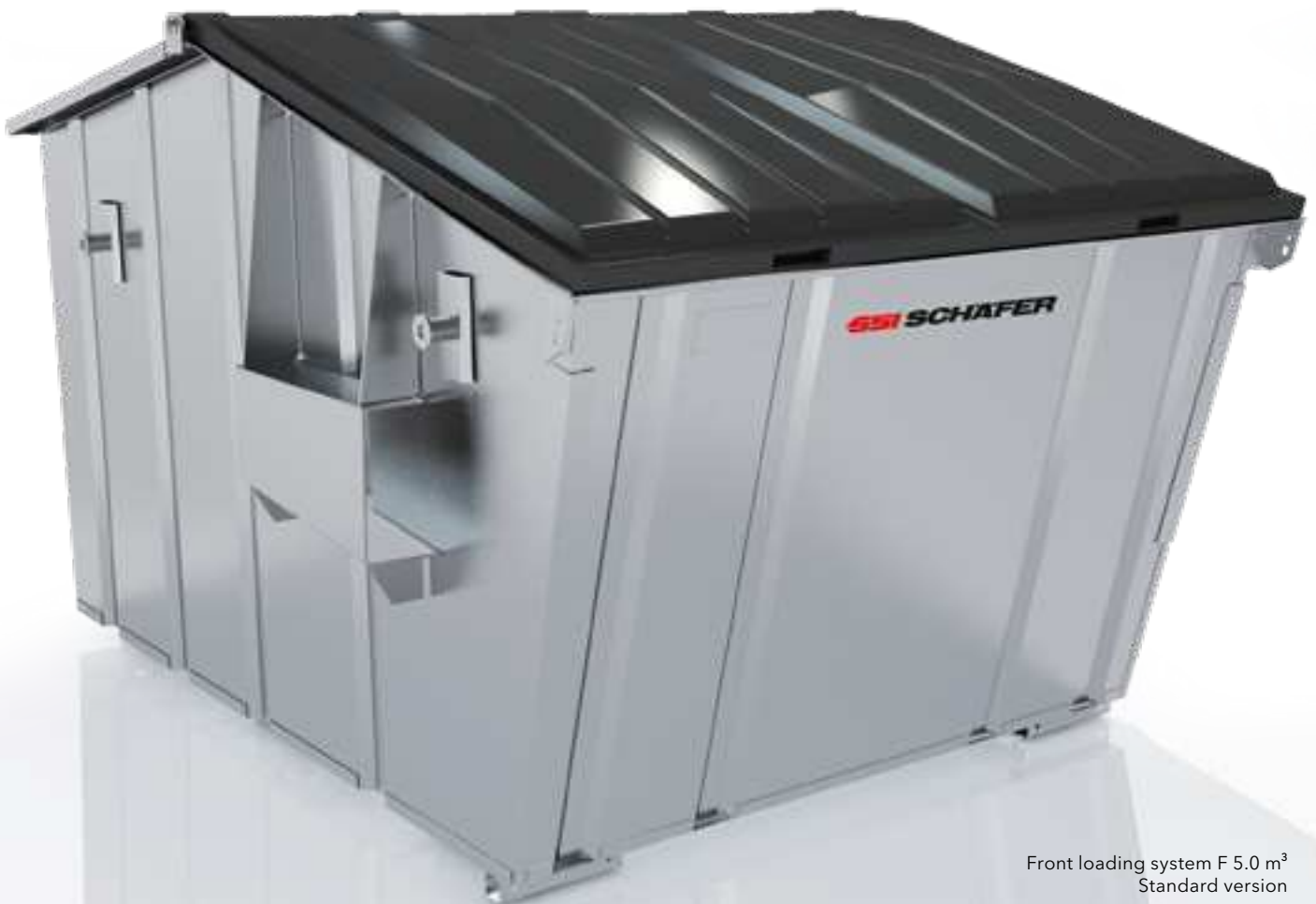
Front loading system F 5.0 m 3 Standard version