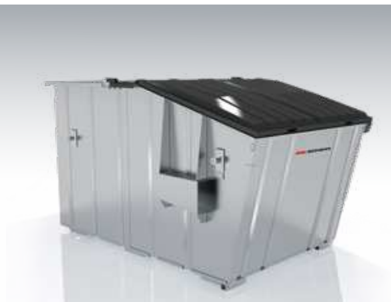
Front loading container F 7.5 m 3 - Standard version