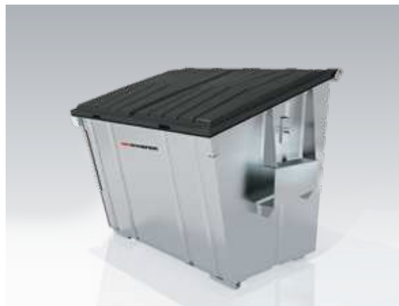
Front loading container F 2.5 m 3 - Standard version