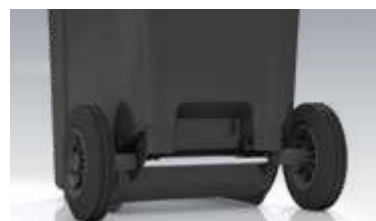
Integrated foothold DU eXtra 180 l