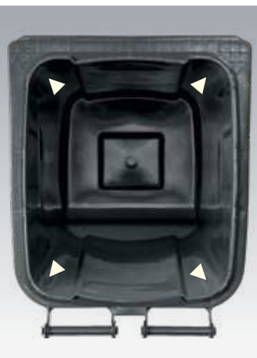
Robust wall construction DU eXtra 140, 240 l