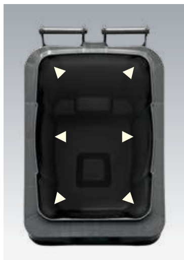
Robust wall construction DU eXtra 180 l