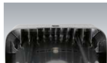
Additional supporting ribs