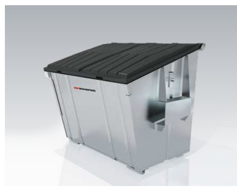
Front loading container F 2.5 m<sup>3</sup> - Standard version