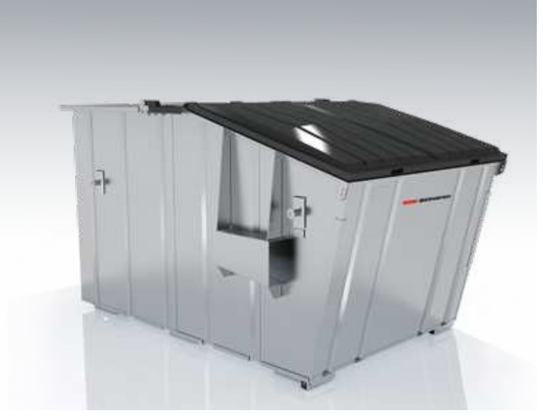
Front loading container F 7.5 m³ - Standard version