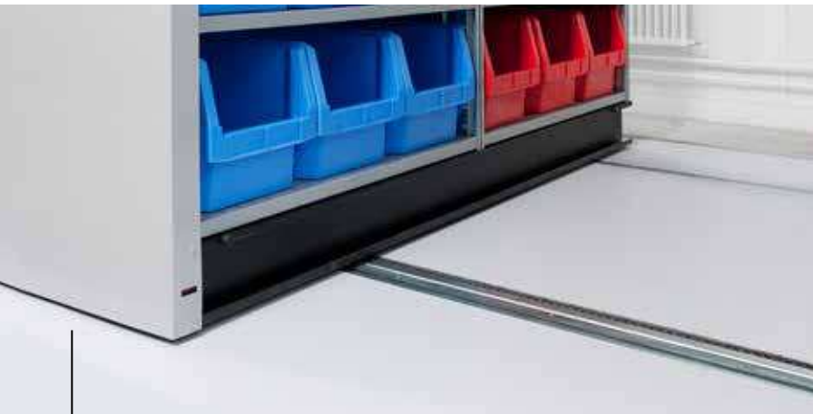
Rails set into floor, therefore no trip hazard