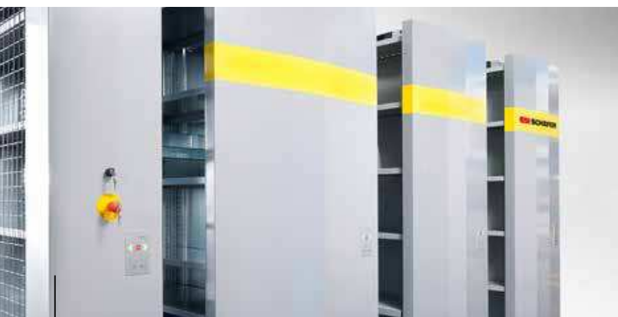
Control options distance controls as access for fire prevention or for ventilating archived documents