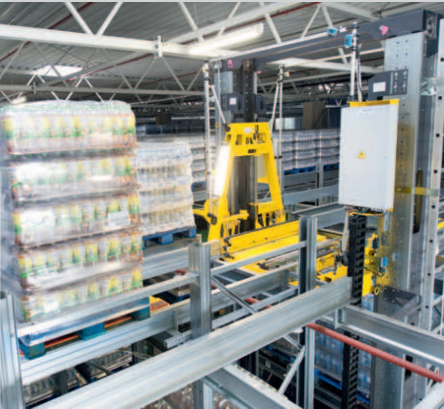
The extremely flexible SOS moves on two rails and does not need an upper guide rail