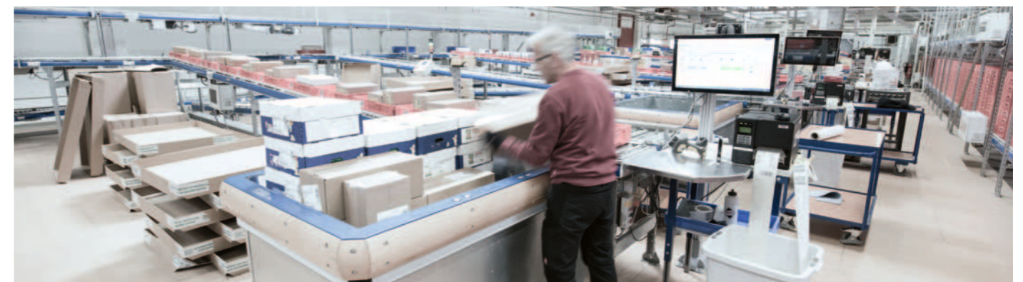
In the packing area, employees label the cartons and put them onto the goods-out pallets recipient-friendly and according to store layout

outgoing goods area. In this way, 750 pallets per shift are prepared for loading in outgoing goods in Erlensee.