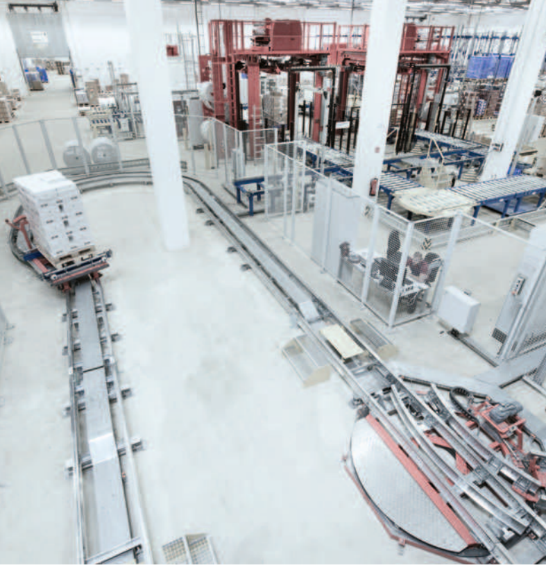
Transport between points of demand via a rail guided vehicle system