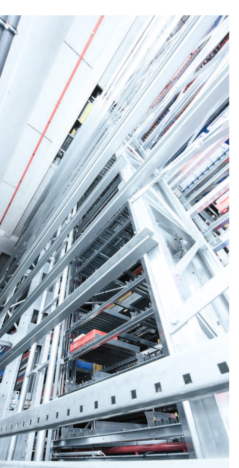
The miniload harbours 136,000 storage locations for double-deep storage