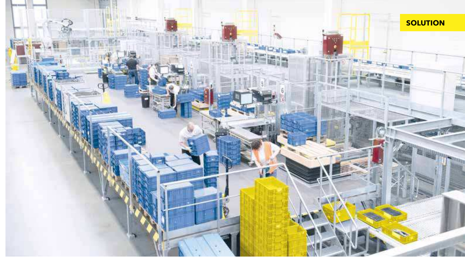
The transfer carriage delivers source pallets that are not delivered in system totes to the manual repacking stations

The palleted incoming goods from approximately 30 external parts suppliers are inspected and received in incoming goods and then transferred to the pallet conveyor system at one of the four dispatch locations. On a vertical conveyor, the pallets are transported to a staging area and from there move along on a bridge structure to the high bay warehouse.