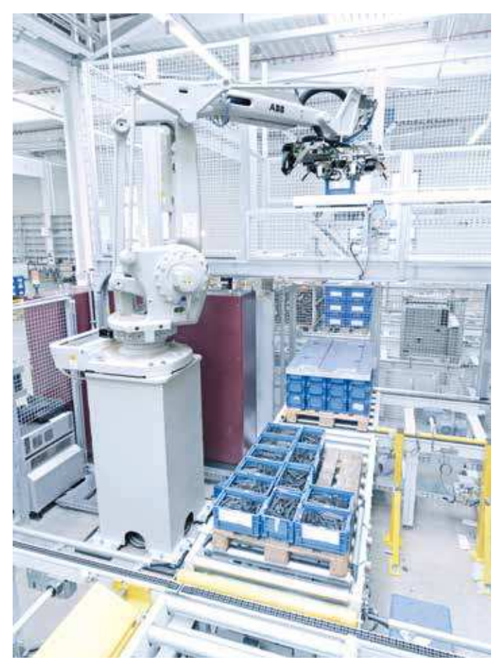
The robot is equipped with a special gripper finger system for transferring.

Robotic applications assume the fully automated depalletizing process, transferring each bin onto the bin conveyor system, which then are transported to the automated miniload system. The particular challenge was the robot teaching process, because four different bin types are used. The solution: State-of-the-art image recognition linked with the device control system and SAP EWM. First, the depalletizing robots uncover the pallets. Then, a camera system captures and analyzes the bin types and the position, calculating the approach mode for the grippers.