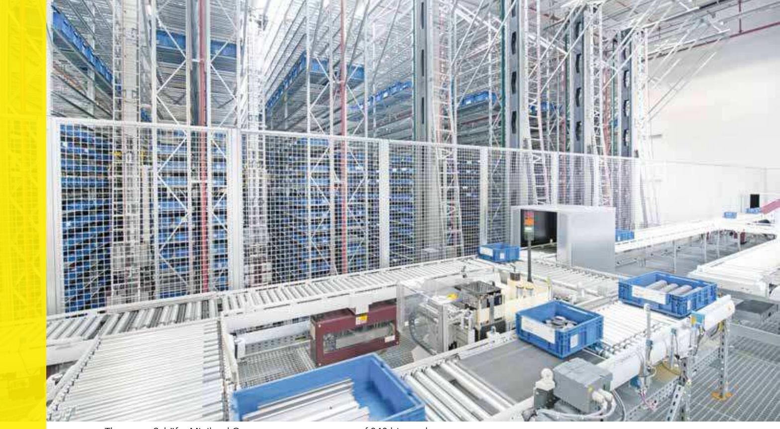
The seven Schäfer Miniload Cranes generate a turnover of 840 bins an hour.