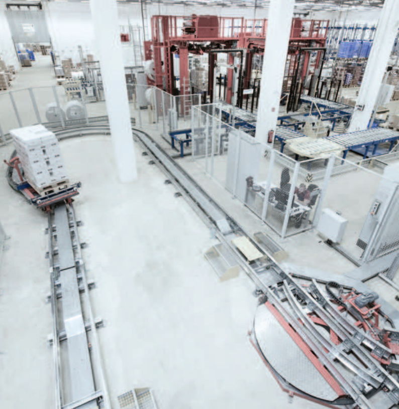
Transport between points of demand via a rail guided vehicle system