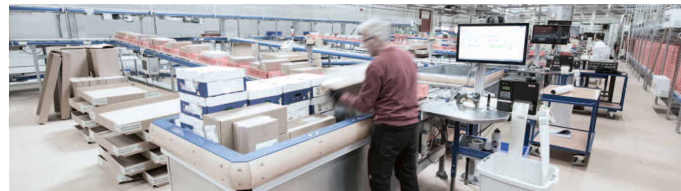
In the packing area, employees label the cartons and put them onto the goods-out pallets recipient-friendly and according to store layout

outgoing goods area. In this way, 750 pallets per shift are prepared for loading in outgoing goods in Erlensee.