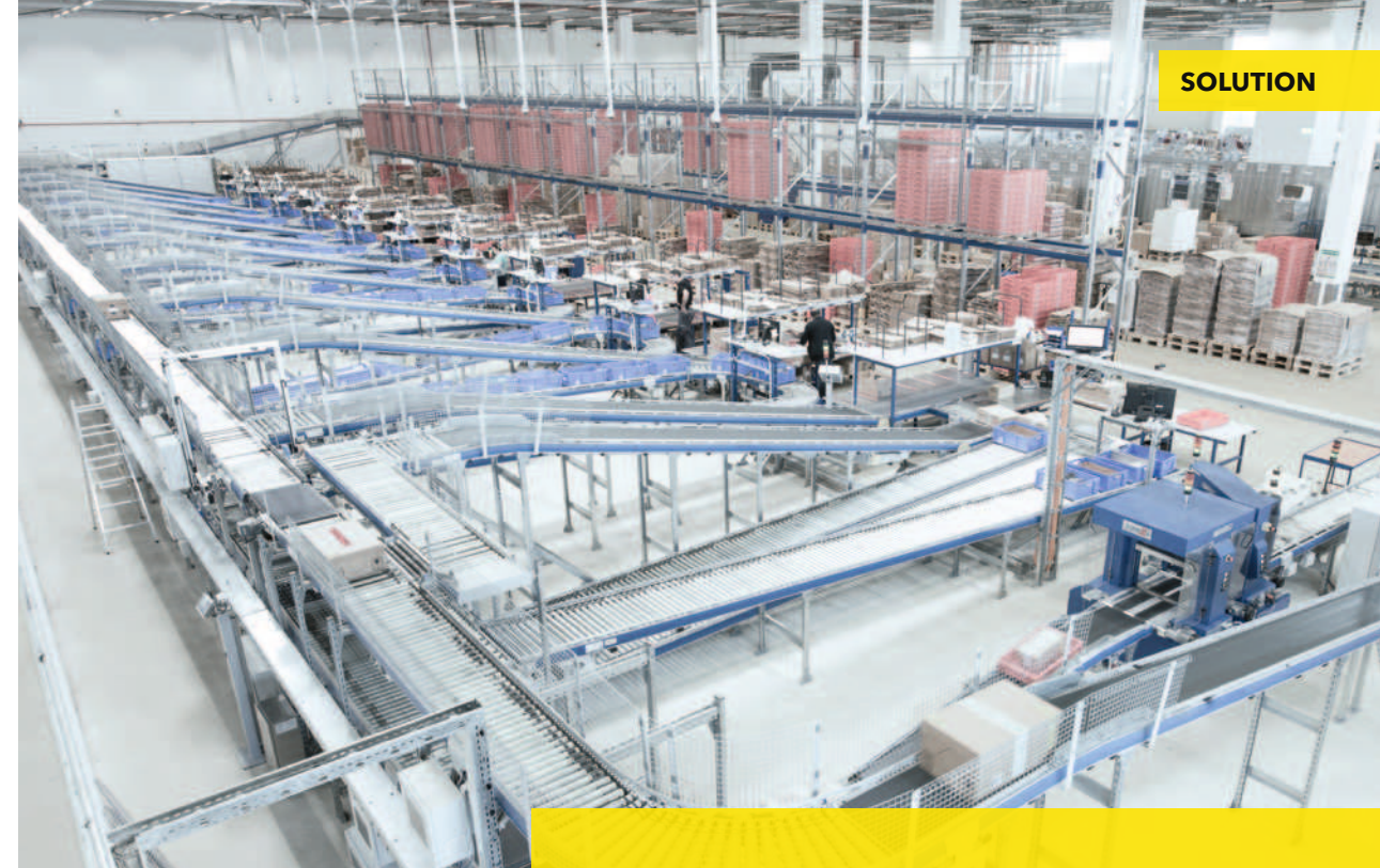
Picking locations for multi-order-picking