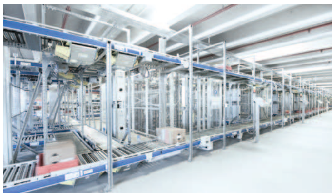
Connecting conveying system of the miniload from goods-in to the picking and shipping locations