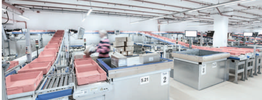
Manual scanning and repacking from pallets onto trays and into bins