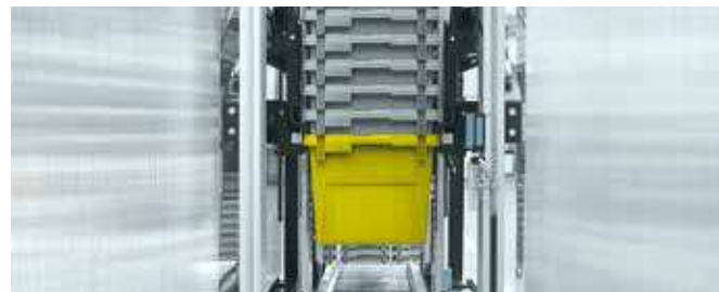
4 PAPER AND BIN HANDLING