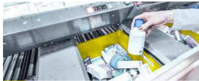
2 WORK STATIONS / ergonomics@work!®